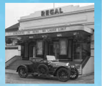
▲ The Cinemas of Northwich 21 January – 3 April Explore the chequered history of the cinemas and theatres of Northwich.