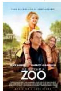
Film Club Evening: 'We Bought a Zoo'