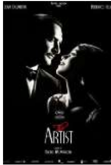
Film Club Evening: 'The Artist'