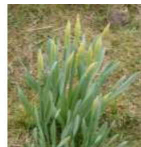
Daffodil Farm on the last Open Day. Flowers are still not open.