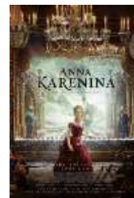
Film Club Evening: 'Anna Karenina'